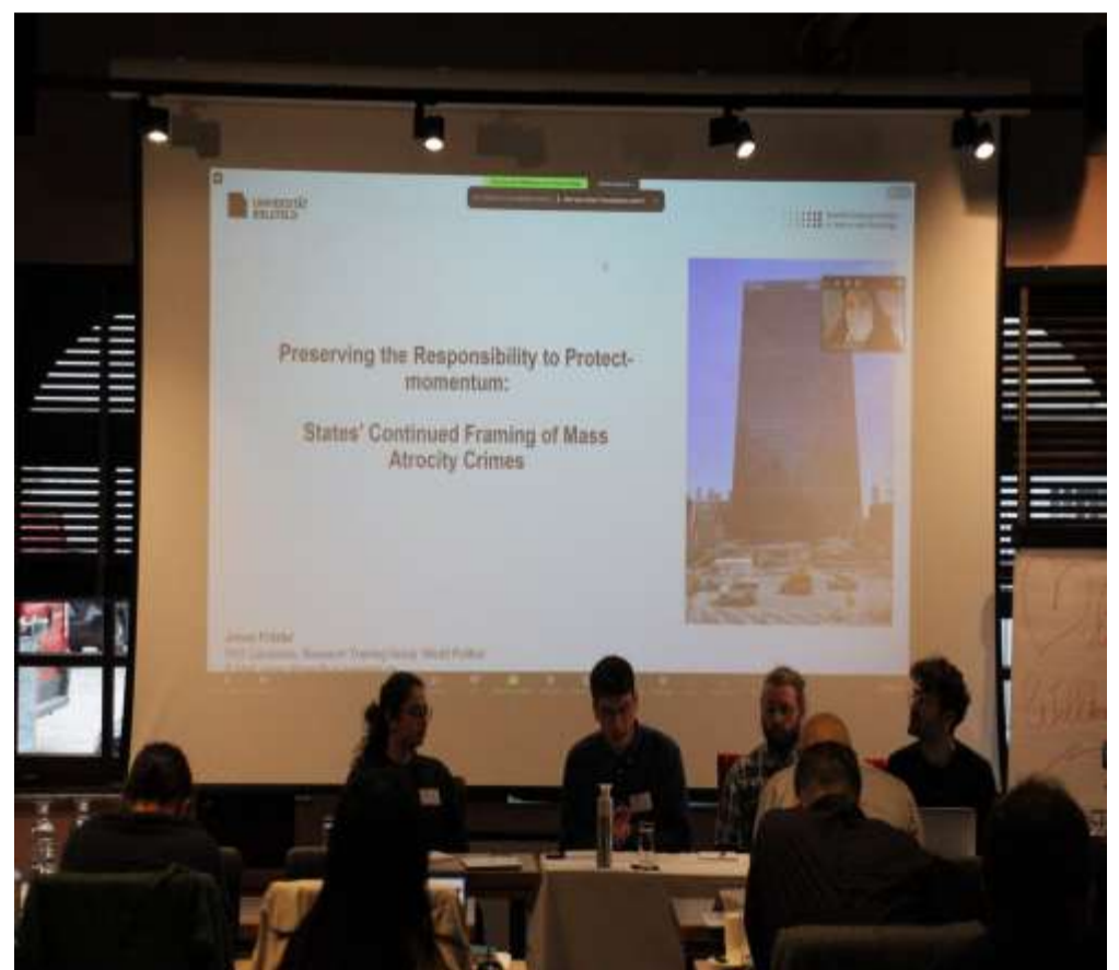
Annual Retreat of the Institute for World Society in Bad Salzulfen, 10-11 November 2022