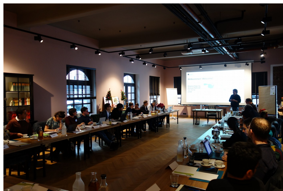
Photo of the annual retreat of the Institute for "World Society Research" in Bad Salzuflen 12/2019.